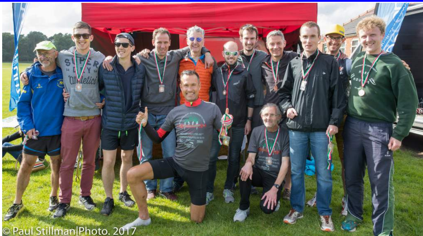
The men's team finished third in the Welsh Castles Relay after an impressive team effort.